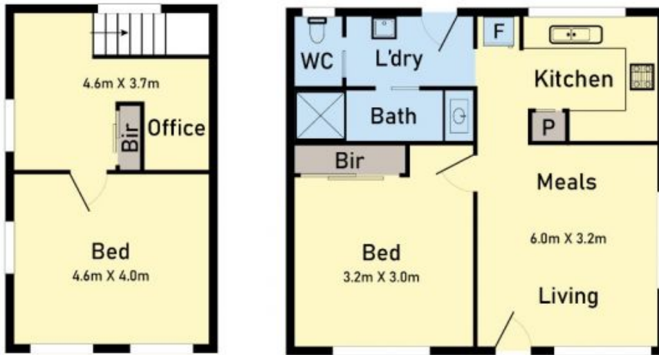
Bungalow (Not In Position)